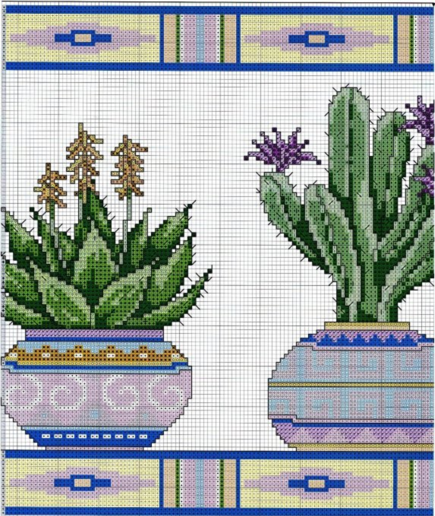
Cactus Row - stitched on a 32" x 15" piece of 14 count Ivory Aida (design size 26" x 9") using 2 strands of floss for Cross Stitch and 1 strand for Backstitch. It was custom framed.

Grey area indicates last row of previous section of design.